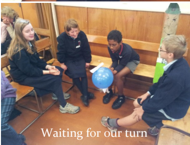
Waiting for our turn