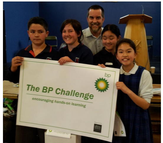
Over all competition winners