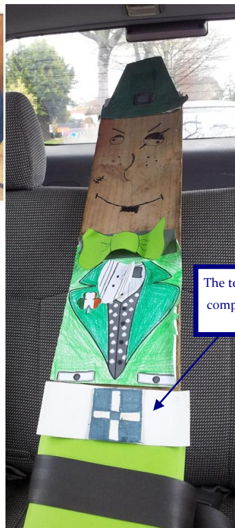
The team mascot on the way to the competition. Note the seat belt