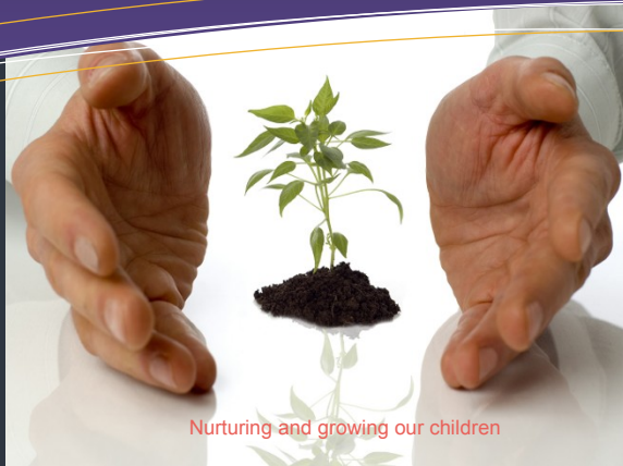
Nurturing and growing our children